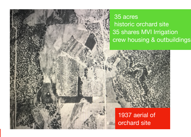
Historic Orchard Property & Infrastructure